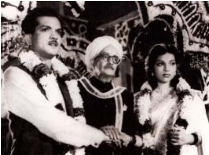
L.V.Prasad with Bhanumati in a still from Grihapravesham, 1945 in which he acted and directed