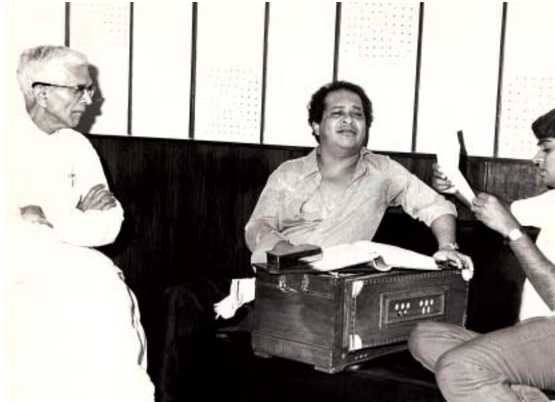
L.V.Prasad with Music Director Lakshmikant during the production of Ek Dooje ke Liye