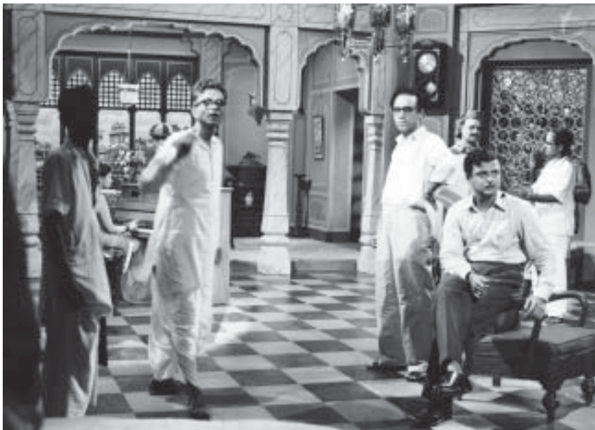
L.V.Prasad on the sets of Miss Mary with Gemini Ganesan (Sitting) and Om Prakash (Far behind, Looking at the Camera), 1957