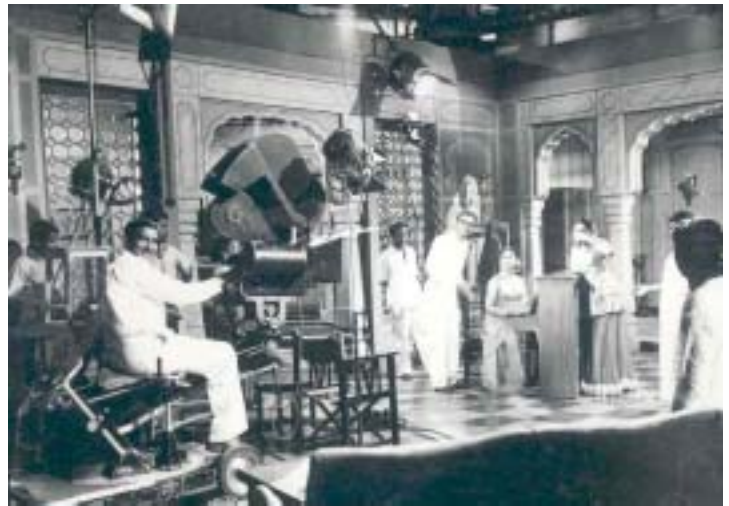
L.V.Prasad on the sets of Miss Mary with Meena Kumari, 1957