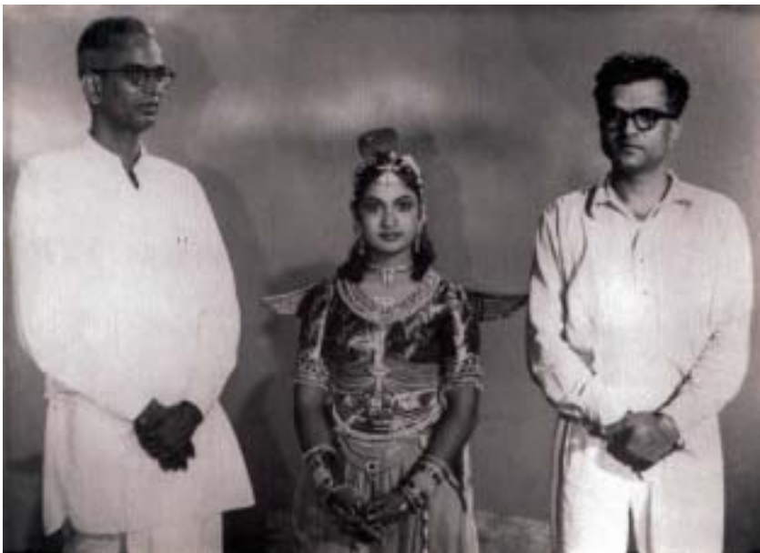
L.V.Prasad and Chakrapani with Savitri on the sets of Pelli Chesu Choodu, 1952